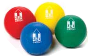
CATCH FOAM SOFTBALLS

To see a complete CATCH product listing, visit FlagHouse.com today!