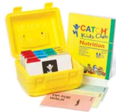
CATCH KIDS CLUB ACTIVITY BOX AND NUTRITION MANUAL