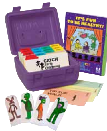
CATCH EARLY CHILDHOOD TEACHER'S MANUAL, ACTIVITY BOX, AND HAND PUPPETS