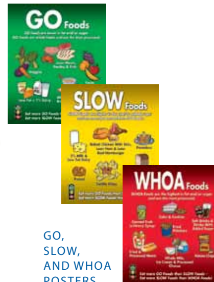
GO, SLOW, AND WHOA POSTERS