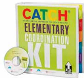
CATCH ELEMENTARY COORDINATION KIT